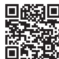
QR code 1