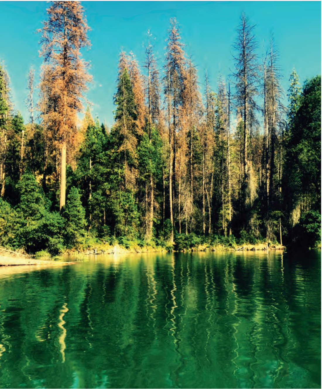
Photo taken at family vacation in Bass Lake, CA