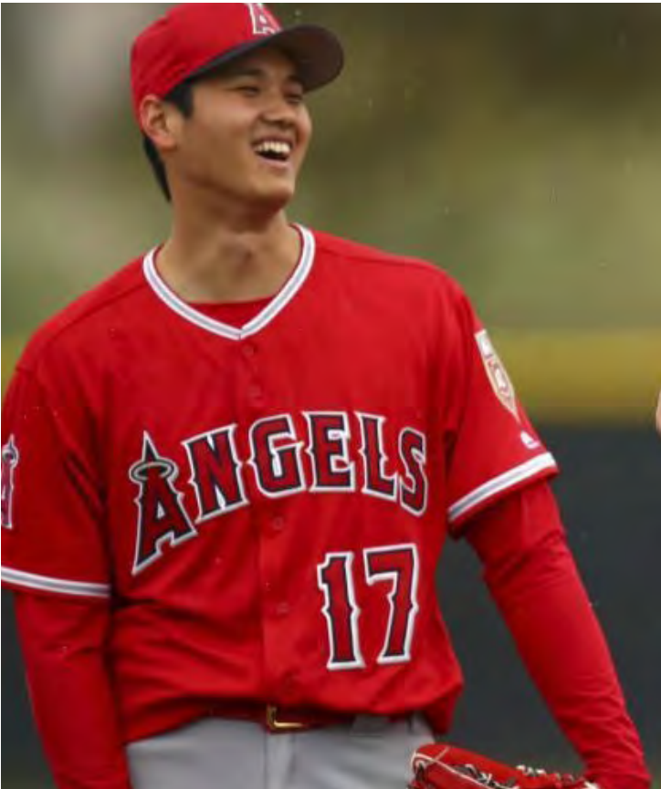
Angels manager Mike Scioscia carefully consider how Ohtani is off to the regular season in MLB.